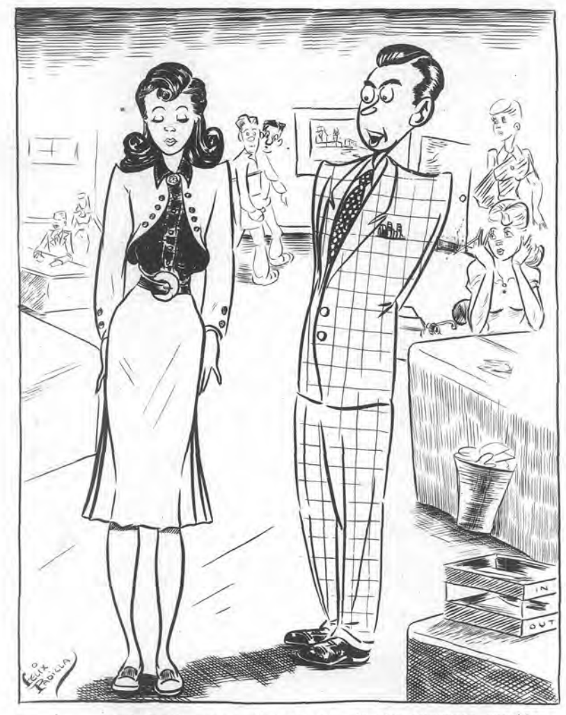
and furthermore, the penalty is the supreme sacrifice, no typewriter eraser for three weeks.